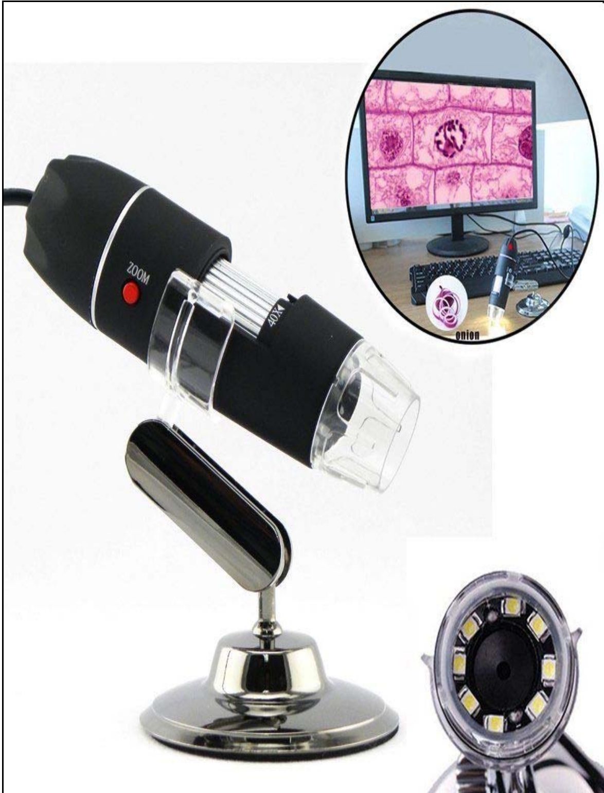
1000x 8 Led Usb digital microscope.