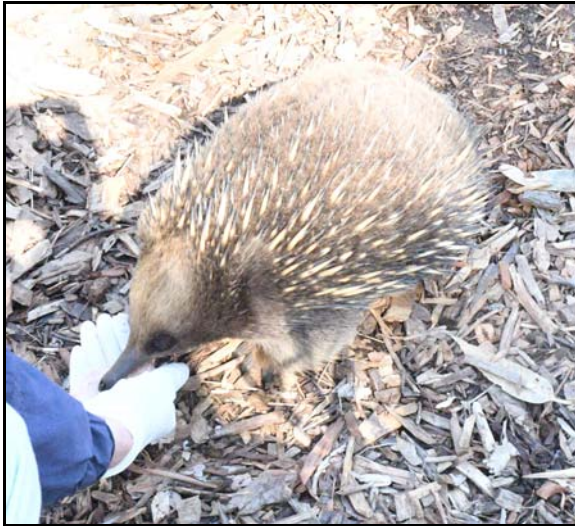
Blind three legged echidna

enjoyed feeding the kangaroos, the 3 legged echidna and the tawny frogmouth.