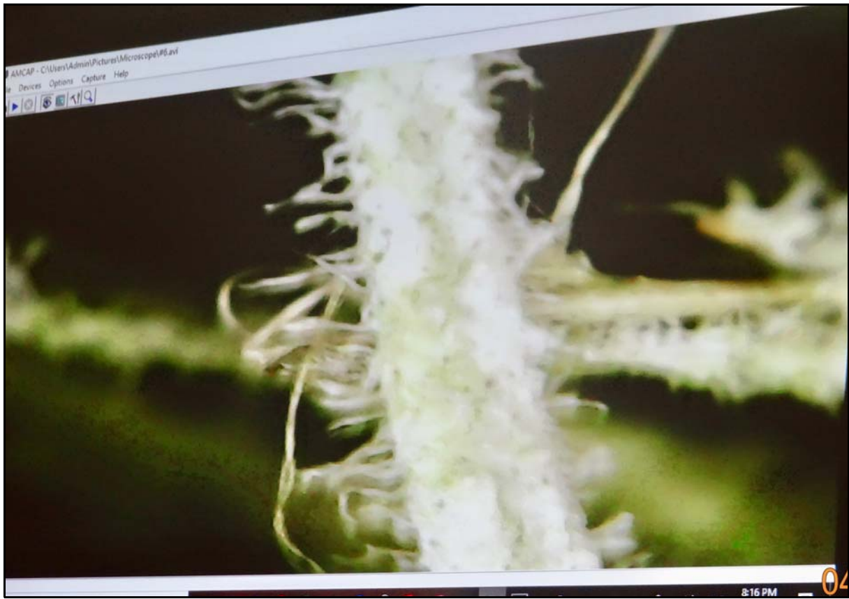
Another photo of trichomes.