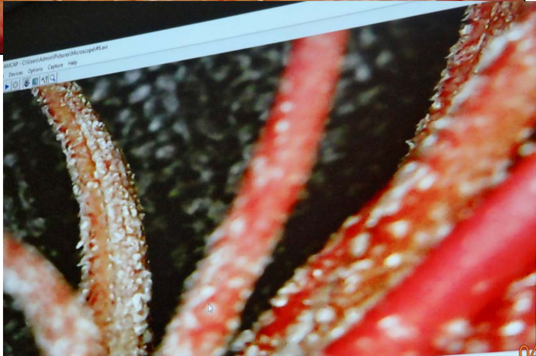
Magnified view of trichomes on a bromeliad.