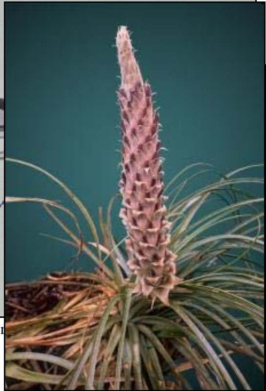
Puya raimondii Rodales National Park